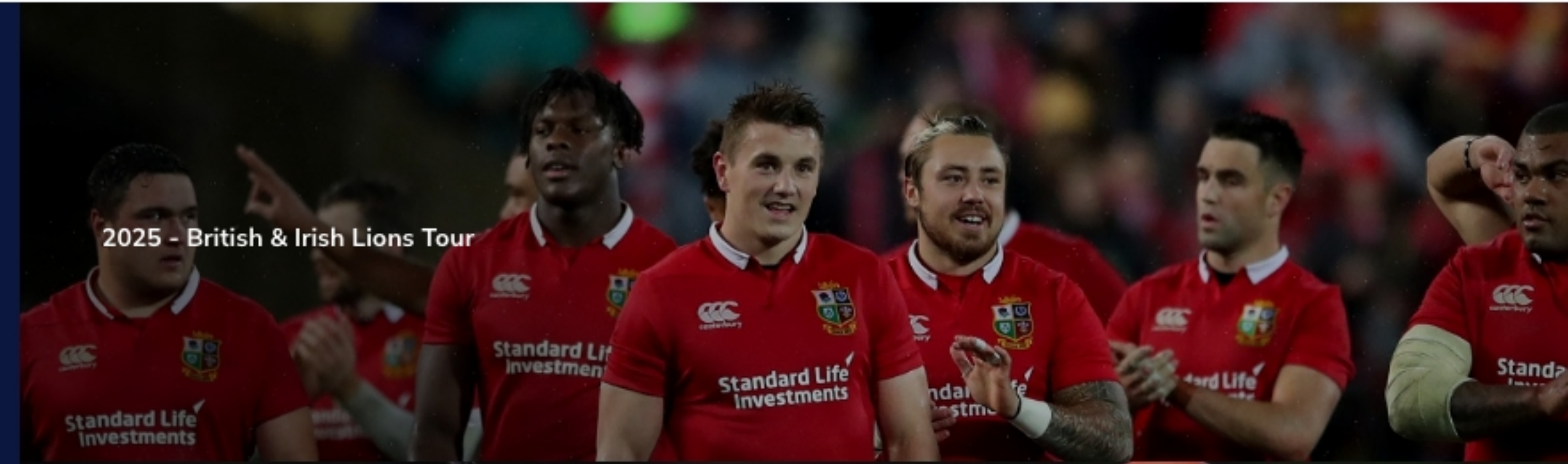
2025 - British & Irish Lions Tour

From cricket and rugby to football and polo, the Gold Coast plays host to sporting teams, competitions and events from across the globe.