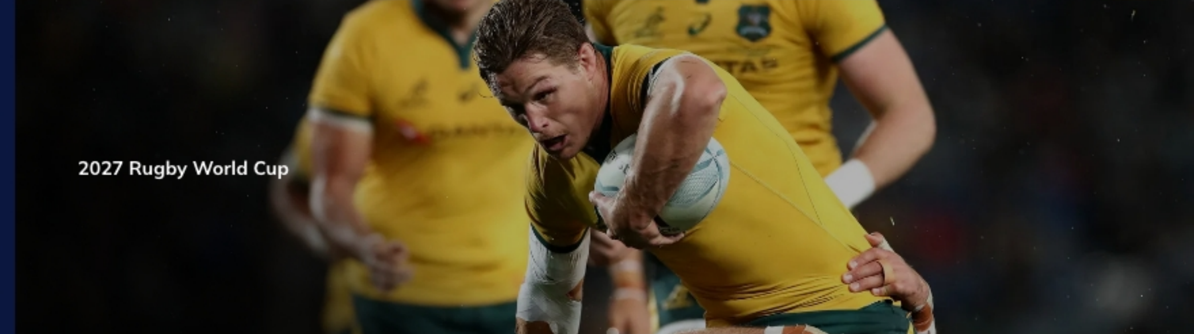
2027 Rugby World Cup