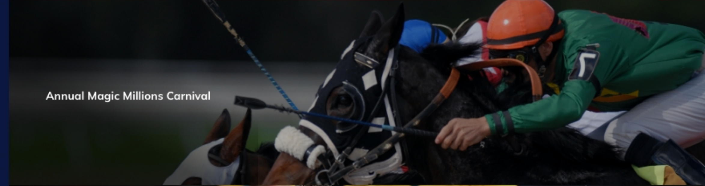
Annual Magic Millions Carnival