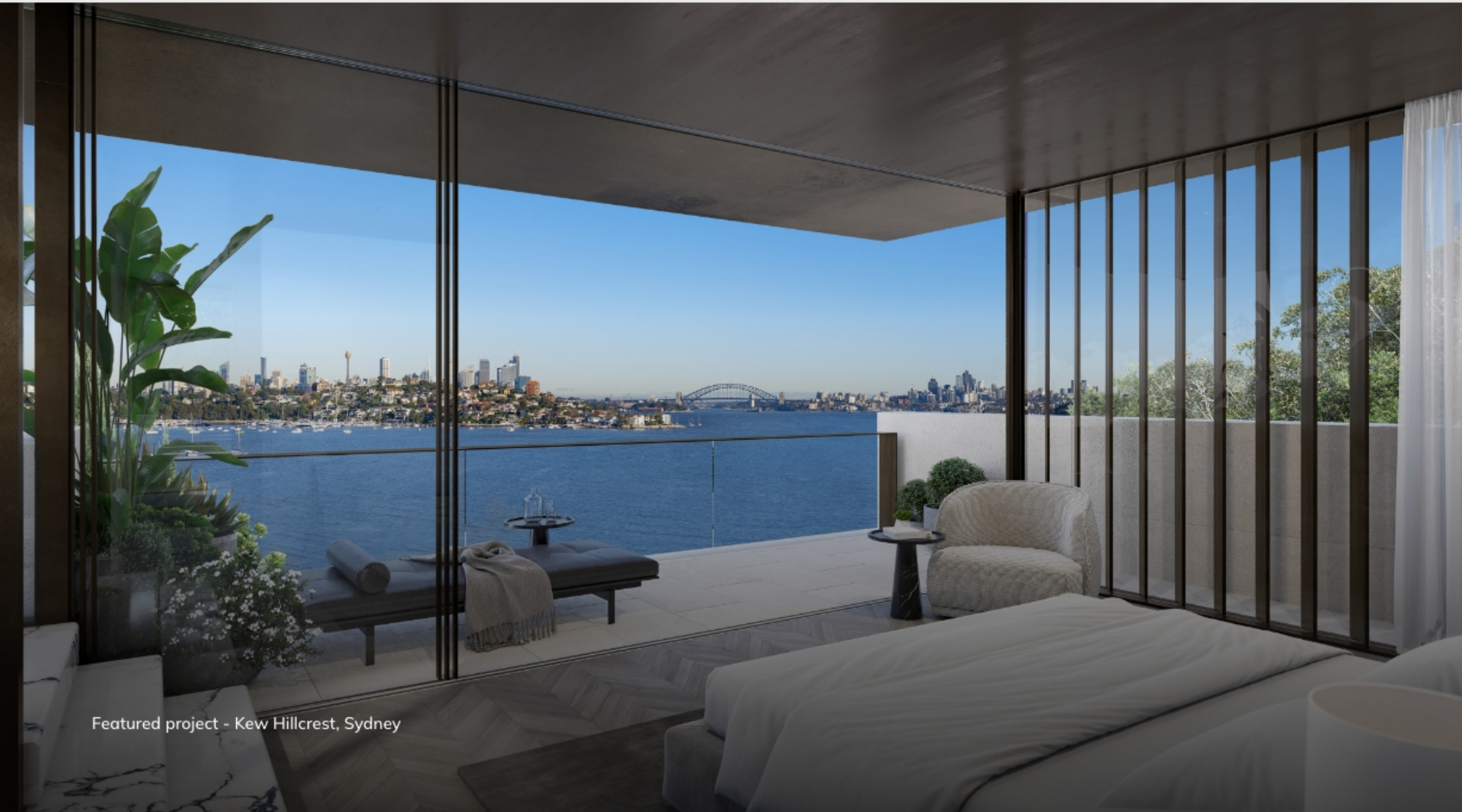
Featured project - Kew Hillcrest, Sydney